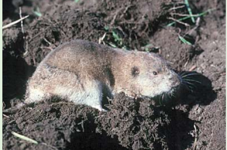
Plains pocket gopher

It is important that the controls used are legal, effective and relatively inexpensive. For obvious reasons, control schemes should not endanger humans and should not endanger other wildlife. They should also be environmentally friendly and as humane as possible.