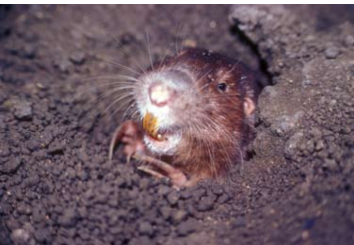
Plains pocket gopher

N orthern pocket gophers ( Thomomys talpoides ) live underground year-round in burrow systems that are often extensive and elaborate. Their range in southern Manitoba, as shown on the map on the back of this publication, includes some of our most important cropland. Their survival dictates spending warmer months collecting food to tide them over winter. Capable of surviving extremely harsh conditions, pocket gopher populations can expand rapidly when conditions are good. Unfortunately, good conditions are created when farmers grow high quality forage crops, like alfalfa, that they prefer to feed on. Pocket gophers can quickly ruin a field of alfalfa by feeding on taproots and smothering new growth with soil they push out of their burrow entrances.