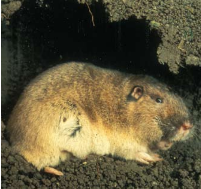
Plains Pocket gopher