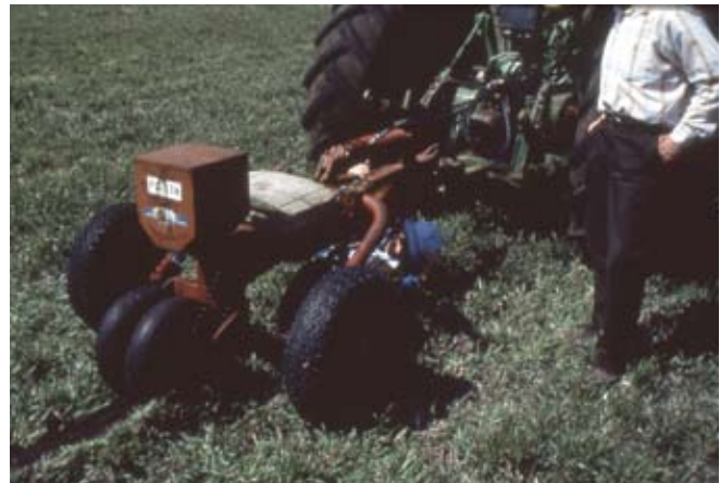
Artificial burrow builder

Many factors can influence bait acceptance and the success of a baiting program. Among them are proper bait placement, soil type, soil moisture and availability of green forage. Rotating rodenticide types can also improve success.