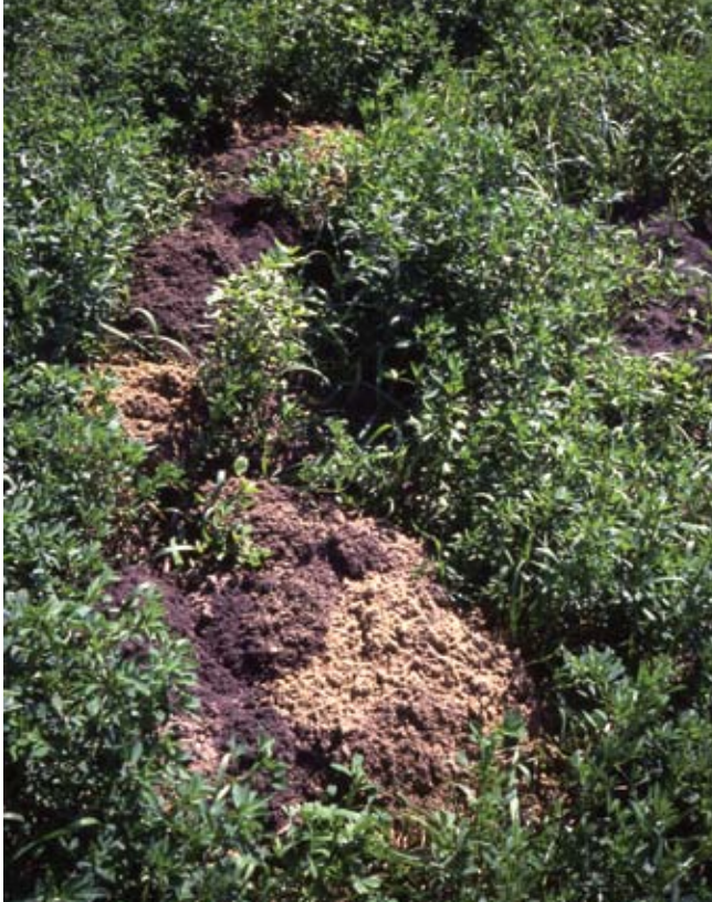
Pocket gopher mounds in alfalfa can reduce yield and stand longevity, and damage equipment.

show pocket gophers prefer alfalfa over native grasses, partly because of alfalfa's high water content, so it's no coincidence that many alfalfa producers are the most affected. Pocket gopher damage in alfalfa reduces stand longevity and has been shown to result in an average yield loss of 23 per cent.