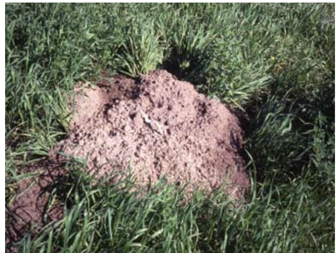
Pocket gopher mound

Despite differences in range and habitat, the northern pocket gopher behaves the same as its cousins elsewhere. It is a digging creature that constructs a complex burrow system to locate and gain access to food. The burrows provide year-round shelter from predators and weather. Gophers also use them as transportation corridors in which to disperse and find mates.