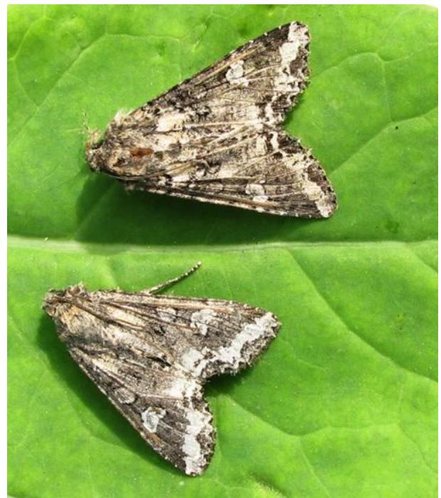
Figure 2. Bertha armyworm moths