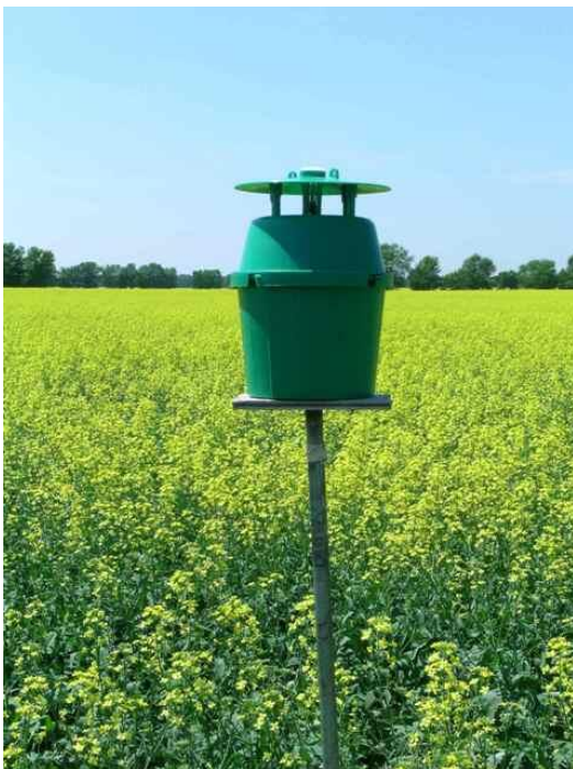
Figure 1. Trap for monitoring bertha armyworm

The cumulative moth counts from the traps, which are presented in the table below, can not predict what the level of larvae will be in the field a trap is in, but can be used, in conjunction with counts from other traps in a region, to determine areas of the province at higher risk and where increased monitoring of fields for larvae may be necessary.