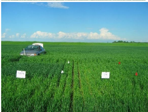
Example 2. Winter wheat showing dramatic growth and colour change between no N and high rate. Final yield 88 bu/ac on left, 52 bu/ac on right.