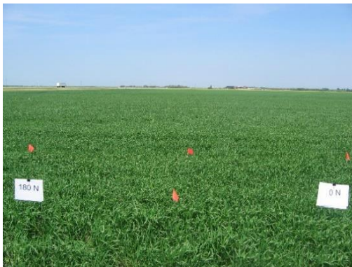
Example 1. Fertilized spring wheat, showing no difference in growth or colour. Final yield 68 bu/ac on left (high N) , 65 bu/ac on right (no added N).

Scout seeded fields for typical N deficiency – yellowing of older, bottom leaves. Excessive waterlogging may cause similar symptoms. A trained eye can discern severe from slight deficiencies, especially if a high N reference strip or cell is established at seeding. (See Examples below).