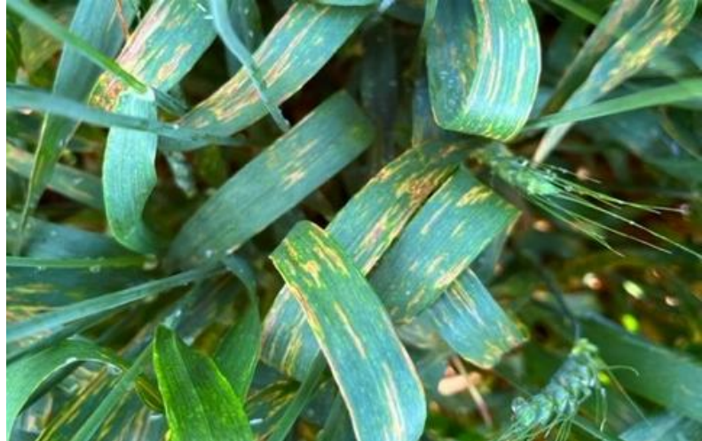
Bacterial leaf streak on wheat

Finally, in my first visits to fields, as part of our annual Soybean disease survey, I came across some Phytophthora root rot . A number of the plants were completely wilted, while others that were yellowed and partly wilted showed the distinctive browning symptoms at the base of plants and creeping up the stems. The distribution in this field, in the Central region, was small patches and only at trace levels. However, given the abundance of moisture this spring and early summer it is not surprising to see this fungus from a group often referred to as the “water moulds.”